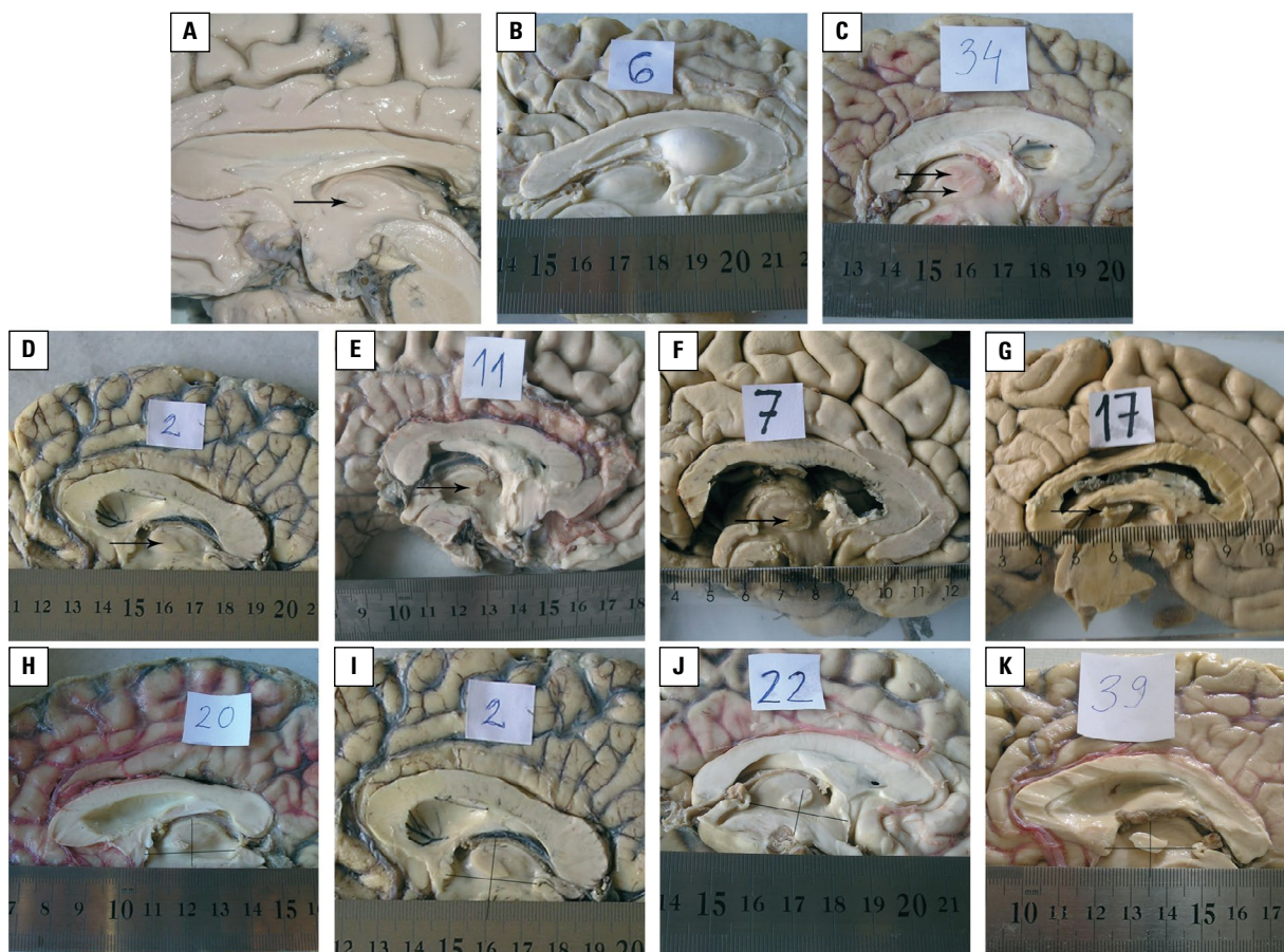
Figure 1. Massa intermedia (MI) in Serbian brains — appearance: A. Single MI; B. Absence of MI; C. Double MI in a 56-year-old female; different shapes and sizes of MI; D. Large MI in a 51-year-old female; E. Tiny MI in an 81-year-old male; F. Large but short MI in a 76-year-old female; G. Long MI in an 80-year-old female; position of MI; H. MI located in the anterosuperior quadrant; I. MI located mainly in the anterosuperior, partly in posterosuperior quadrant; J. MI equally located in the anterosuperior and posterosuperior quadrant; K. MI located in all four quadrants, mostly in anterosuperior.