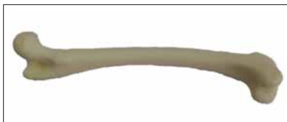
Figure 3. The dog femur produced with using stereolithography method.

In SLA method, UV rays are used on photo polymer liquid for the formation of the structure. The procedure is done layer by layer. In these methods, the surface of a model forms a wavy surface therefore the smoothness and the accuracy of the model