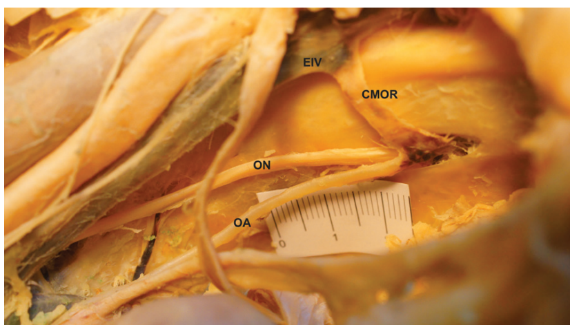
Figure 2. Left side of corona mortis (CMOR) and its relationship with the obturator and external iliac systems; EIV — external iliac vein; ON — obturator nerve; OA — obturator artery.

and above this, the obturator artery (OA). Above these two is located the obturator nerve (ON). Immediately from where the OV emerges through the obturator duct, there is an anastomosis compatible with CMOR following a slightly inclined position on the vertical axis. From anterior to posterior it passes over the superior branch of the pubis and flows into the external iliac vein (EIV) (Fig. 1). This CMOR measures 33 mm in length on the path described, and has a gauge of 3 mm. The distance from the pubic symphysis to the mouth of the EIV is 67 mm, while the distance from the junction of the CMOR and EIV to the lacunar ligament is 19 mm. The distance from the pubic symphysis to the other end of the CMOR in the obturator foramen is 53 mm.