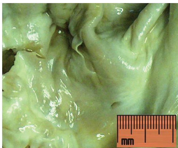
Figure 4. Thebesian valve covering more than 75% of the coronary sinus ostium.

CS during atrial systole. Relatively small number of studies describes echocardiography imaging of the normal TV. Presumably due to its thin nature and small size it is usually visualised occasionally [1, 2, 8].