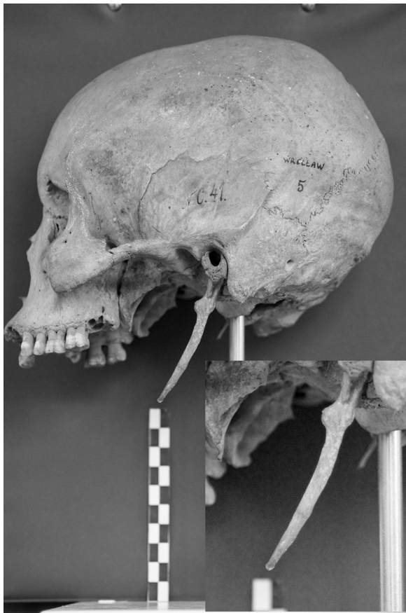
Figure 2. The skull from Puerto Cabello with 3× magnification (right lower corner) of the elongated styloid process with visible area of fracture.