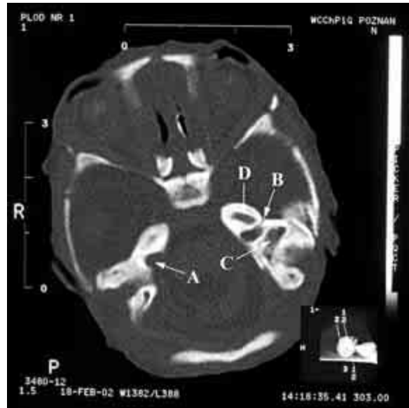
Figure 2. Foetus aged 20 weeks; A — internal acoustic meatus, B — initial part of facial canal between vestibule (C) and cochlea (D).