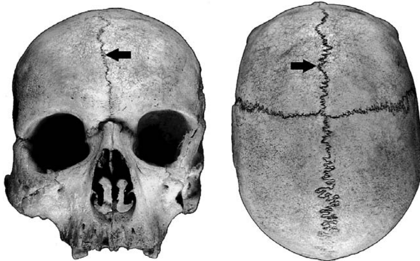
Figure 1. Location of the metopic suture (indicated by arrows) in the human skull.

Although it is rare to find this suture in adults, its presence is not considered pathological. However, premature fusion of the metopic suture results in trigonocephaly and it has been calculated that this craniosynostosis stands at 400 per 1,000,000 births in humans [14].