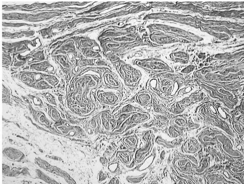
Figure 2. Distal bulbous portion of the vagus nerve variation reported here. At the distal margin of the vagus nerve, as it abuts the connective tissue capsule of the left inferior aspect of the thyroid gland, there are disorganised microfascicles formed by connective tissue stroma ( \times 33 , H&E)