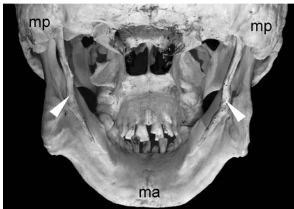
Figure 2. Posterior view of the ossified stylohyoid ligaments (indicated by arrows); ma — mandible, mp — mastoid process.

An anatomical study was performed on the ossified stylohyoid ligaments on both sides of the skull. The length of the osseous complex (the styloid process plus the ossified part of the stylohyoid ligament) was measured using a digital sliding calliper.