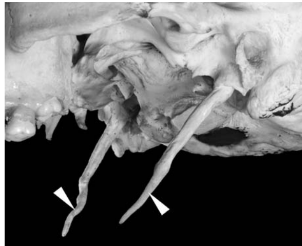
Figure 3. Lateral view of the ossified stylohyoid ligaments (indicated by arrows).

Visual inspection of the right and left stylohyoid complex revealed complete ossification of the styloid process and stylohyoid ligament. The ossified parts of the stylohyoid ligaments are clearly visible (Fig. 2, 3). Nevertheless, it is difficult to determine the exact border be-