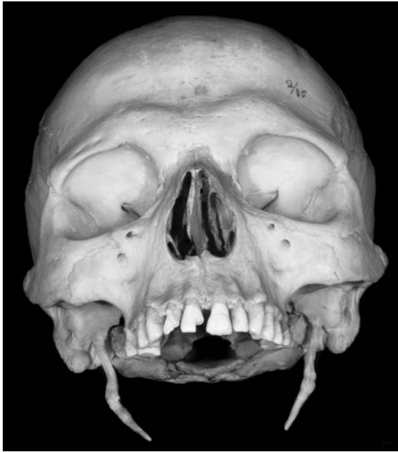
Figure 1. Anterior view of the skull with bilateral ossification of the stylohyoid ligaments (the mandible was removed).