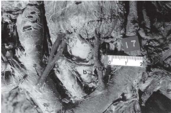
Figure 4. Inferior thyroid vein, double, with a termination in the right brachiocephalic vein (a) and in the left brachiocephalic vein (b).

cited in the literature studied [3, 12]. Chevrel et al. [3] report cases of two terminations but do not state whether the veins are independent; Remmert et al. [12] report that in 20% of cases this vein is not single. In our study we found two independent veins in their origin, path and termination in 16.7%. Dissection only gave us access to the macroscopically visible drainage surface, which we confirmed to be the upper part of the gland. However, by means of anastomoses it is possible to drain the medial part (25.0%) and the lower part (6.7%).