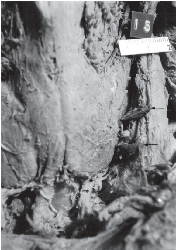
Figure 2. Medial thyroid vein, double, with a direct termination in the internal jugular vein.