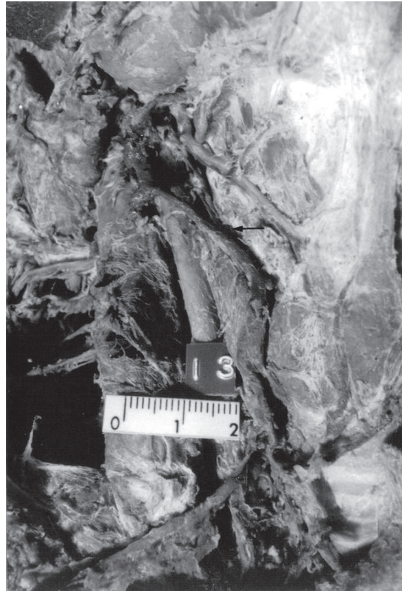
Figure 1. Superior thyroid vein, single, with a double termination in the internal jugular vein.

The superior thyroid vein was present in all samples and on both sides (100%) and was single (83.3%) or double (16.7%) (Fig. 1). It was formed by the confluence of two branches, termed primary branches, in 80.1% of samples or more than two branches, termed secondary branches, in 19.9%.