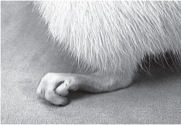
Figure 5. Appearance of contracture formation.

It would be helpful, therefore, to be familiar with the phenomenon of autotomy and know which rats are least likely to mutilate themselves. It is reported that female Sprague-Dawley rats are significantly less likely to perform autotomy than males [40]. In contrast to Weber et al. [40], Carr et al. [6] mentioned that Lewis rats have been demonstrated to exhibit the least autotomy.