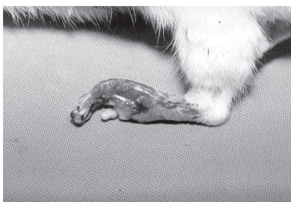
Figure 4. Appearance of severe autotomy.

Although it has been suggested that this behaviour is simply an effort to shed an insensate appendage, several researchers have attributed it to the animal's response to a painful condition that it perceives as arising from the denervated body part, named anaesthesia dolorosa . The painful perception arising from the injured nerve may originate from impulses spontaneously generated in the regenerating axonal sprouts because of mechanical compression within the neuroma [8, 39].