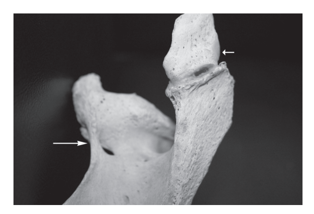
Figure 1. A right dry scapula with co-existence of os acromiale (small arrow) and suprascapular osseous bridge (large arrow).

surements were made with the assistance of a digital sliding calliper with a sensitivity of 0.001 mm.