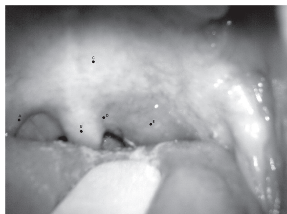
Figure 1. Anatomy of retropharyngeal space and the aneurysm of the extracranial portion of left internal carotid; A — palatoglossal arch; B — uvula; C — soft palate; D — palatine tonsil; E — suspicious mass.

left tonsil and lateral pharyngeal wall into the midline (Fig. 1). Endoscopic examination revealed a bulge in the posterior and in the left lateral pharyngeal wall without mucosa lesions. There were no signs of infection or tenderness around the neck. Auscultation evidenced no pathological carotid bruit. Under the impression of left parapharyngeal tumour,