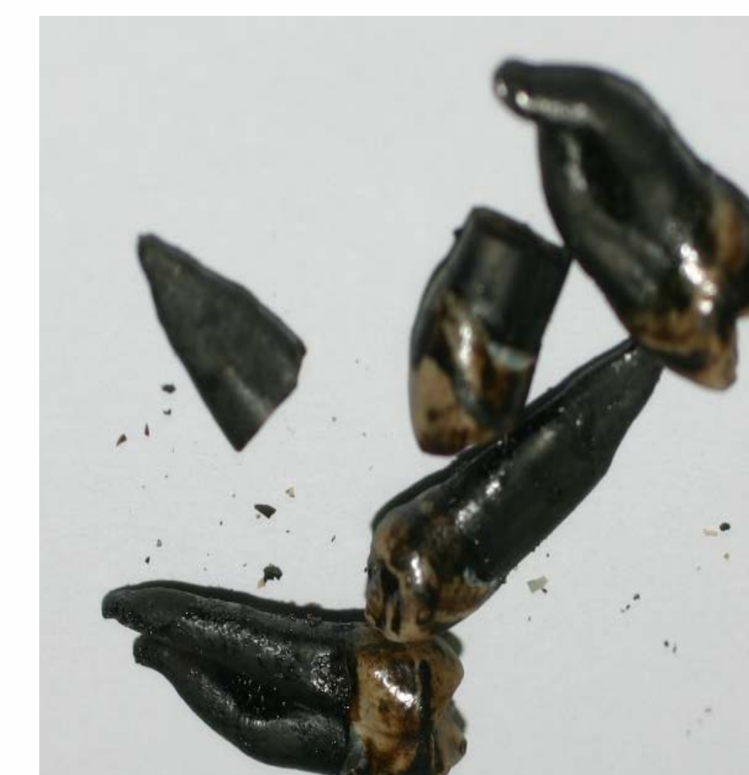
Figure 1. The profile of mtDNA HVI region obtained for a tooth exposed to 500°C for 5 min. Insert shows the tooth after combustion