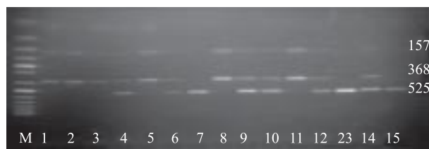
Figure 1. Representative analysis of ERCC1 1907 T>C polymorphism (lanes: 7, 13, 15 — CC homozygotes, lanes: 4, 6, 9, 10, 12, 14 — CT heterozygotes, lanes: 1, 2, 3, 5, 8 11 — TT homozygotes, M — DNA ladder)

Statistical analysis. Chi-square test was used to compare the characteristics of the patient groups divided according to ERCC1 19007 T>C polymorphism. The U-Mann-Whitney test and Kruskal-Wallis ANOVA median test were used for testing equality of population medians among groups. Kaplan-Meier method was used for the comparison of survival probability between the groups of different ERCC1 genotypes. Finally, the Cox regression model with stepwise selection procedures by minimum AIC was used to establish factors affecting patient survival.