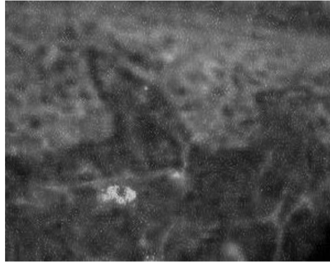
Fig. 3. Plasmacytoid blood dendritic cell in dermis, stained with antibodies directed against BDCA-2 antigen. Direct immunofluorescence, \times 400 .