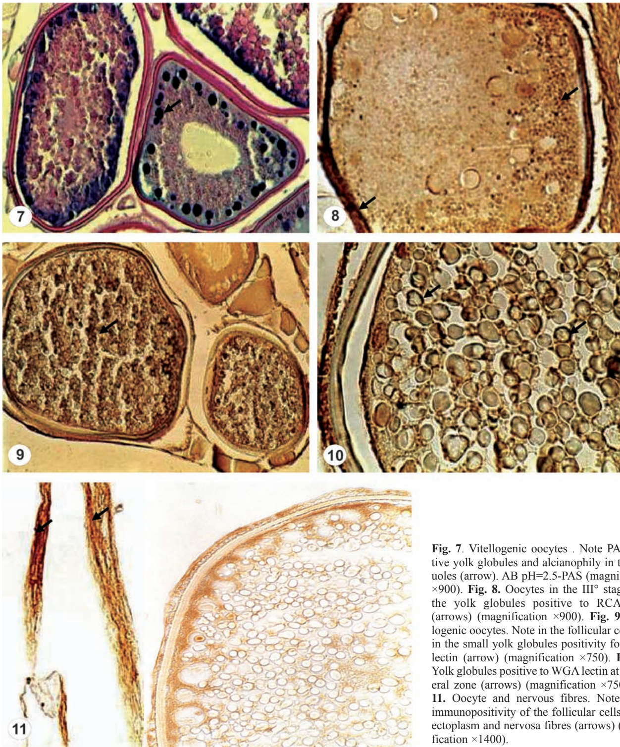
Fig. 7. Vitellogenic oocytes . Note PAS positive yolk globules and alcianophilic vacuoles (arrow). AB pH=2.5-PAS (magnification \times 900 ). Fig. 8. Oocytes in the III o stage, note the yolk globules positive to RCA lectin (arrows) (magnification \times 900 ). Fig. 9. Vitellogenic oocytes. Note in the follicular cells and in the small yolk globules positivity for ConA lectin (arrow) (magnification \times 750 ). Fig. 10. Yolk globules positive to WGA lectin at peripheral zone (arrows) (magnification \times 750 ). Fig. 11. Oocyte and nervous fibres. Note nNOS immunopositivity of the follicular cells, of the ectoplasm and nervosa fibres (arrows) (magnification \times 1400 ).

blue, their chemical constitution remaining however unchanged.