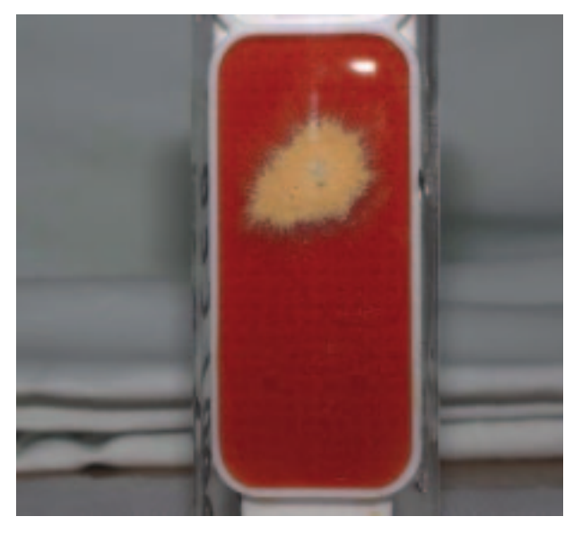
Figure 2. Trichophyton mentagrophytes culture on BioMerieux medium