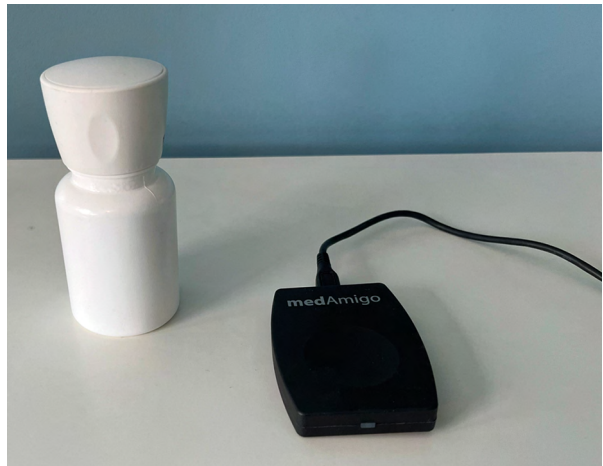
Figure 1. The medication Adherence Monitoring System (MEMS), consisted of an electronic cap, medication container, and a reader, enabling the programming of the device as well as transferring the adherence data

We have conducted a prospective cohort study of patients with diagnosed HF. Twenty-five participants were enrolled in the period from April 2021 to March 2022, both directly after HF-related hospitalization in the Cardiology Department of the Central Clinical Hospital in Lodz, as well as in the cardiology outpatient clinic. Eligible patients were aged 18 years or older, with the diagnosis of HF according to the European Society of Cardiology Guidelines [1], with symptoms in I–III New York Heart Association (NYHA) class and N-terminal pro-B-type natriuretic peptide concentration greater than or equal to 125 pg/mL in patients with sinus rhythm or 365 pg/mL in patients with atrial fibrillation. Exclusion criteria were defined as life expectancy < 1 year, acute coronary syndrome or stroke within the last 3 months, and presence of cognitive impairment that, in the investigator's opinion, prevents the proper use of the monitoring device in accordance with the instructions. The study complied with the Declaration of Helsinki and was approved by the local medical ethics committee. Written