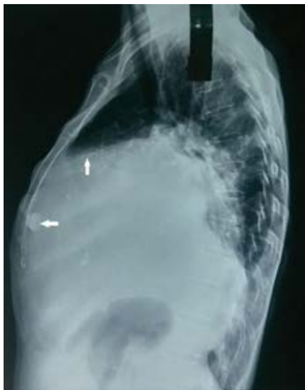
Figure 2. X-Ray chest lateral view showing pericardial calcification (arrows)

with hugely dilated right atrium disproportional to the degree of tricuspid regurgitation and pulmonary arterial hypertension. The pericardium was thickened (8 mm) with dilated inferior vena cava (IVC) (24 mm) with loss of respiratory variation of diameter.