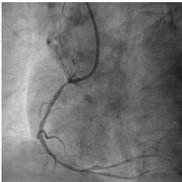
Figure 4. Another runthrough guidewire being parked in aortic sinus, which acted as anchor wire