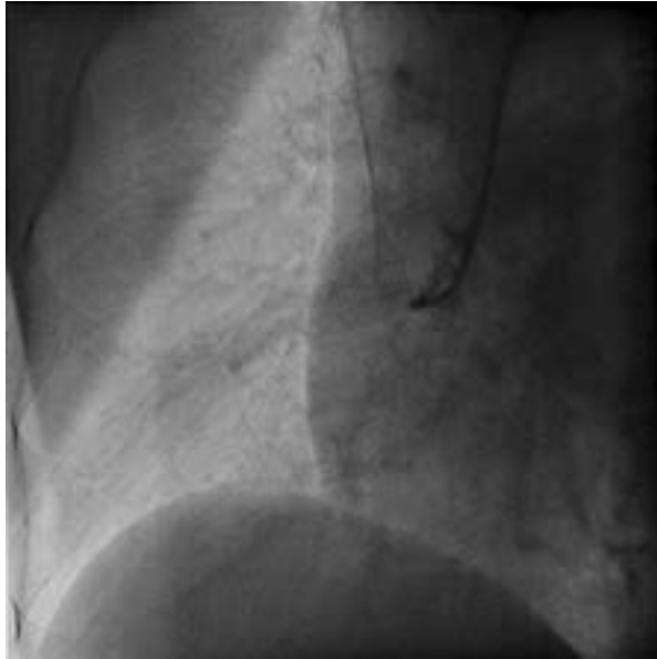
Figure 1. Right coronary artery (RCA) showed aorto-ostial chronic total occlusion