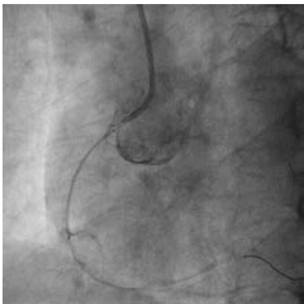
Figure 5. Stent being positioned after mounting over the workhorse wire, while proximal end of the anchor wire was crossed through the most proximal strut of the stent

post dilated with 3.5 x 10 Minitrak non-compliant balloon (Abott, USA) up to 20 atm pressure achieving TIMI 3 flow (Figure 9). The patient was discharged on the third day with aspirin – 150 mg/day, prasugrel – 10 mg/day, atorvastatin – 80 mg/day, metoprolol – 100 mg/day and ramipril – 2.5 mg/day. The patient is doing fine since then with regular follow-ups at our institute.