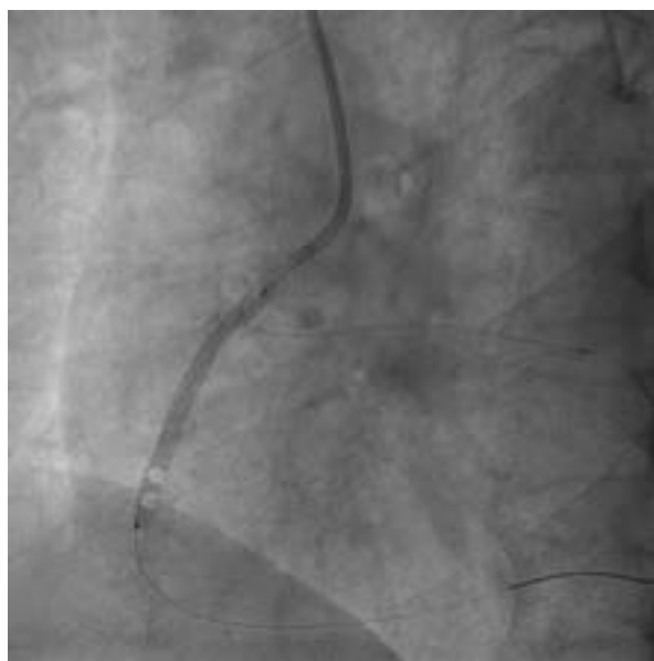
Figure 7. Stent being deployed at 12 atm and anchor wire still holding the proximal end of the stent preventing its distal migration