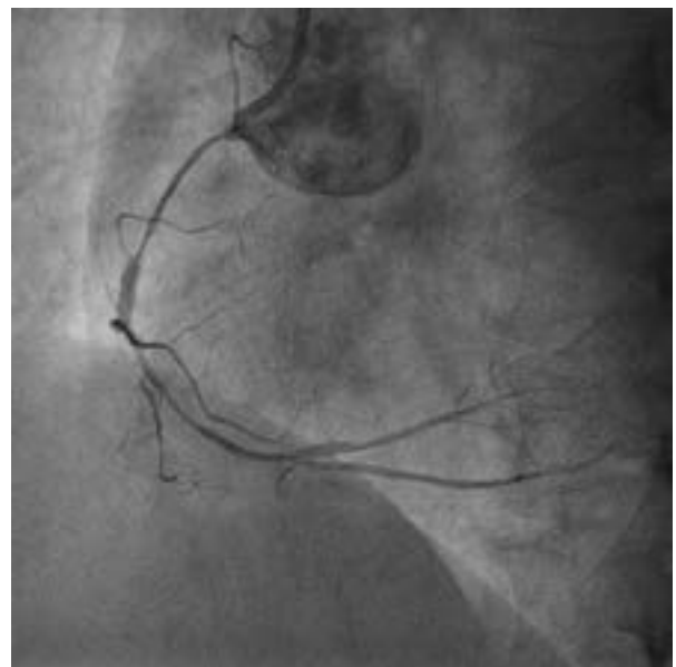
Figure 3. Fielder FC wire being exchanged with Runthrough NS guidewire

the anchor wire was crossed through the most proximal strut of the stent (Figures 5, 6). The stent was advanced carefully to avoid any tangling of the wires. Once properly positioned across the lesion, it was deployed at 12 atm pressure (Figure 7). When the balloon was deflated, the anchor wire was pulled out. The balloon was pulled little beyond the stent and inflated up to 15 atm pressure to achieve ostial flaring of the stent (Figure 8). It was further