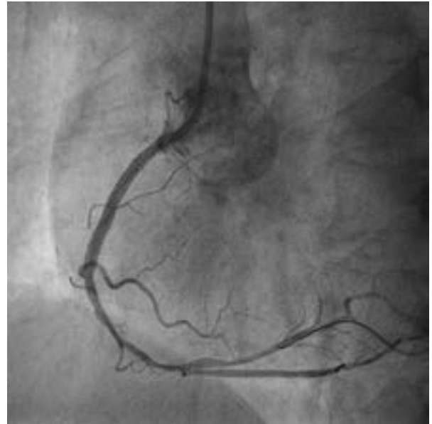
Figure 9. RCA after post dilatation by non-compliant balloon at higher pressure achieving TIMI 3 flow

technique would be the one, which will ensure complete coverage of the ostium with precise stent positioning and implantation. Gutierrez-Chico et al. [6] in their series of 156 patients with ostial lesions in main vessels (Medina 001 or 010) compared the results between the Szabo technique and conventional treatment guided by angiography and observed a distinct advantage with the Szabo technique, with lower rates of stent malposition (6.4% vs. 41%; P < 0.0001 ), stent protrusion in the side branch/ /aorta (6.4% vs. 34.6%, P < 0.0003 ) and incomplete stent coverage of the plaque (0% vs. 7.7%).