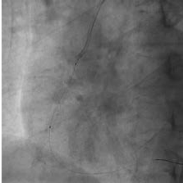
Figure 8. The balloon was pulled little beyond the stent and inflated up to 15 atm pressure to achieve ostial flaring of the stent after removing the anchor wire