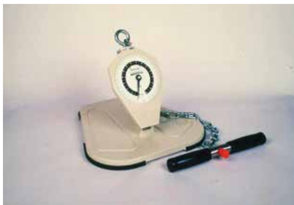
Figure 1. Baseline® back leg and chest dynamometer

test and 1minute active break between; 11–12 rate of Borg scale);