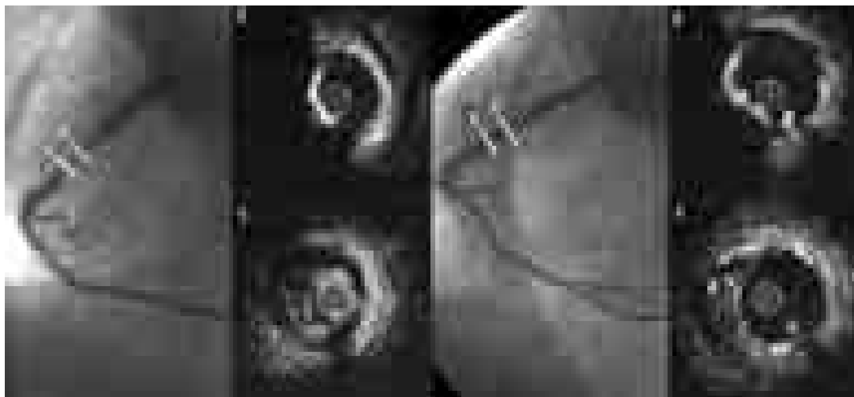
Figure 3. Example of a procedure performed in RCA with the direct stenting technique. There is an arc of calcium greater than 180° before stenting (on the left). After the procedure incomplete expansion of the stent is seen (on the right)

We found that, in the presence of the same circumferential amount of calcium, the variation in LA was similar in the two groups. Even in the subgroup with the largest circumferential amount of calcium (between 180° and 360°) similar values in LA increase were found in Group 1 and Group 2 ( 3.42 \pm 2.01^\circ vs. 3.58 \pm 2.41^\circ , respectively, p = \text{NS} ). The finding that balloon predilatation does not ameliorate stent expansion, even in the cross-section with the greatest amount of calcium, further supports the adoption of a strategy based on direct stenting. Recently Dudek et al. [11] have shown that in non-calcified plaques the symmetry indices and stent expansion are similar both during direct stenting and stenting with balloon predilatation. Together with our observations, this evidence can confirm that there is no need to change implantation strategy during stenting (fig. 3).