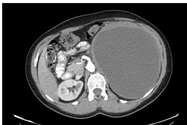
Figure 1. Retroperitoneal pseudocyst on computed tomography (CT) scan

A woman, aged 30 years, was admitted to the hospital because of a giant retroperitoneal space cyst diagnosed by computed tomography (CT). She suffered from mild epigastric pain, periodic vomiting and a feeling of a mass in the upper left quadrant of the abdomen. The first symptoms appeared about 6 months before admission. She had a subtotal thyroidectomy for papillary thyroid carcinoma 2 years before. On physical examination, a fixed, elastic tumour of approximately 20 cm in diameter was palpable in the left upper quadrant of the abdominal cavity. Blood pressure and heart rate parameters were normal (RR 120/80 mmHg, HR 72/min). Laboratory analyses (including hormonal tests — methoxycatecholamines in daily urine collection, dexamethasone test, thyroid-stimulating factor (TSH), free triiodothyronine (fT3), and free thyroxine (fT4) did not show any abnormalities. CT revealed a 15 × 19 × 20 cm cyst in the left upper abdominal quadrant, adjacent to the body and tail of the pancreas, spleen, posterior gastric wall, and anterior surface of the left kidney (Fig. 1). The splenic vessels were tense at the upper part of the lesion. The small bowel loops were displaced downward and to the right by the cyst. The wall of the cyst was smooth and 15 mm thick. The content of the cyst was homogeneous without the presence of septa or wall nodules and had a density of 14 Hounsfield units. A CT scan did not show the left adrenal gland, so it was suspected to be the origin of the cyst.