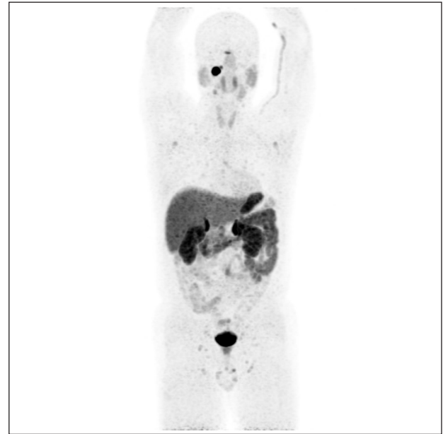
Figure 2. Very good expression of SSTR in cervical lymph nodes with infiltration of the levator veli palatini, sphincter muscle, the posterior wall of the nasopharynx, and pharyngeal tonsils seen in [ 68 Ga]Ga-DOTA-TATE PET/CT in 2020 after 12 years of multimodality treatment