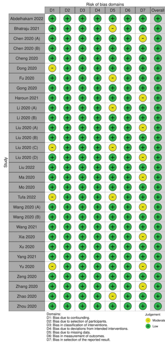
FIGURE S2: A plot of the distribution of review authors' judgements across studies for each risk of bias item.