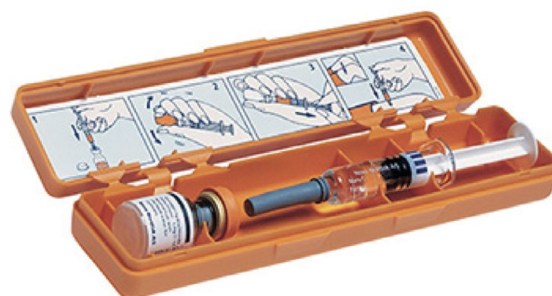
FIGURE 1. A pre-filled syringe with a glucagon

The management of hypoglycaemia in a patient who is conscious and presents symptoms of mild to moderate hypoglycaemia should be directed to oral administration of simple sugars first and then complex sugars which will be released longer. In case of unconscious patients, in addition to protection of the airway, monitoring and intravenous access, intravenous glucose 20% / 5% at a dose of 0.2 g/kg body weight should be administered intravenously until a blood concentration of 100 mg/dL is achieved. If intravenous access is not available, 1 mg of glucagon should be administered intramuscularly (Fig. 1), to increase the release of glucose from the liver. It should be remembered, however, that the