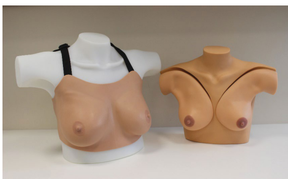
FIGURE 3. Examples of breast examination models.