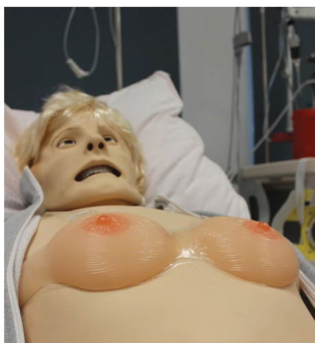
FIGURE 4. Silicone breast model used in the simulator.

It should be remembered that medical simulation consists not only of trainers and simulators (Fig. 3–5). An additional and very important advantage of medical simulation is the possibility of getting communication skills. Interpersonal communication is an extremely important skill that should be acquired by all the graduates of medical universities, including nursing departments. In safe simulation conditions, with the support of a simulated patient, it is possible to shape appropriate situations in which appropriate reactions and behaviours occur (e.g. behaviour in difficult situations, such as cultural/religious differences, death, conflict or aggression) [11–13].