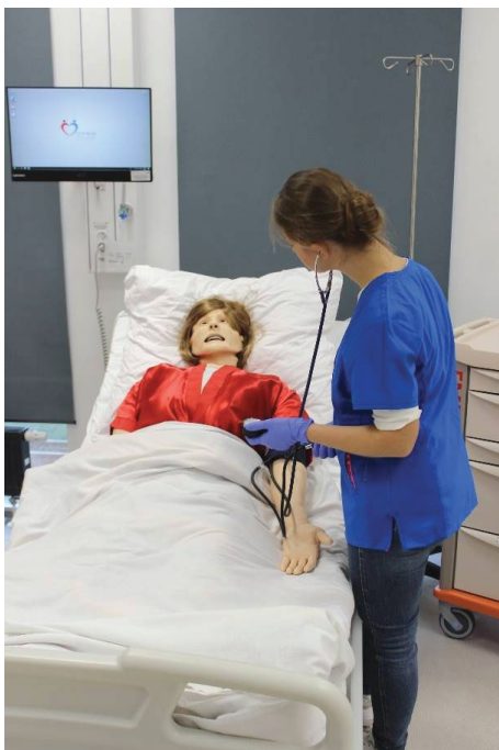
FIGURE 1. Patient examination — using a simulator