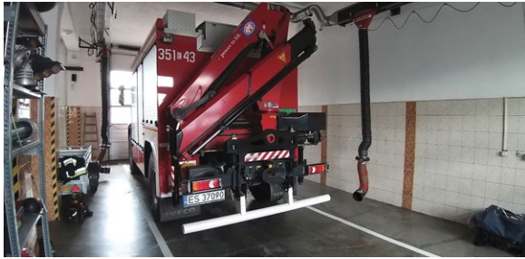
FIGURE 1. A specialized technical rescue vehicle