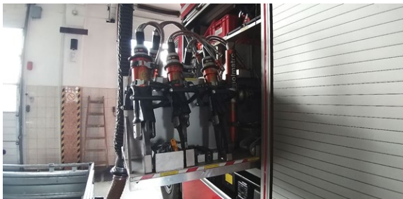
FIGURE 3. Shears and hydraulic thrusters