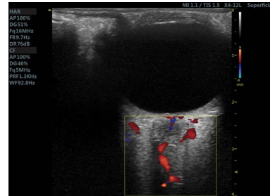
FIGURE 2. Central retinal artery

The optic nerve diameter (OND) is represented on the image as a hypoechoic structure (darker than the environment). The optic nerve sheath diameter (ONSD) is brighter than the optic nerve but still darker than the surrounding tissues.