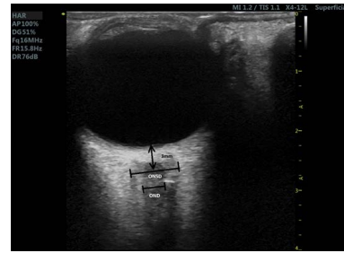
FIGURE 1. Optic nerve (OND) and optic nerve sheath (ONSD)

Measure the diameter of the optic nerve using the "3 X 5" principle meaning that the calculation is made 3 mm from the posterior wall of the orbital globe, where 5 mm means an impassable limit of the correct width of the optic nerve with the capsule (Fig. 1). The correct diameter of the optic nerve for an adult does not exceed 5 mm, for a child 4.5 mm, and for infants 4 mm.