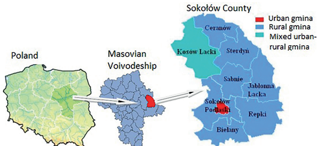
FIGURE 1. Location of Sokołów county [own modification] [2]

emergency room, trauma centre) and which are usually the first of the syndromes in alarm code 1. The main aim of S MRTs is to carry out the tasks of the "S", "B" and AMR Air Ambulance. A condition for effective EMS is the "golden hour" (the time from the event to the beginning of the specialist treatment) and the Platinum Ten (the time from the onset of the event to the beginning of the MRT).