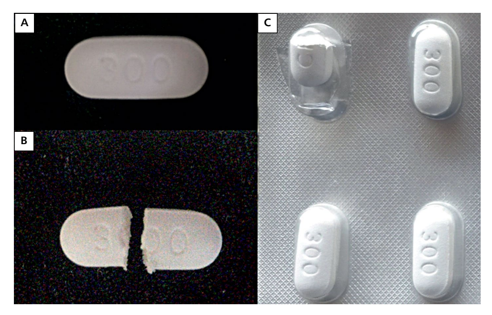
Figure 2. A — appearance of an intact canagliflozin 300 mg tablet; B — appearance of split canagliflozin 300 mg tablet; C — storage of one-half of the split canagliflozin 300 mg tablet of use on the subsequent day

from the medications considered in this study (canagliflozin, metformin, glucagon like peptide 1 receptor agonists and orlistat) were excluded. Patients with at least 6 months follow-up data available were included in the study. The duration of this study was from January 2018 to February 2019. The entire flow of patient recruitment has been elaborated in Figure 1.