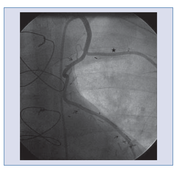
Figure 1. Angiography of left internal mammary artery graft showing patent flow to left anterior descending artery (arrows) and a large proximal side branch (asterisk) extending to the lateral chest wall.

critical stenosis at the middle segment of the LAD and at the proximal segment of the intermediate artery, major OM and diagonal arteries, whereas the right coronary artery was filling retrogradely from the LAD. All of the grafts were patent (saphenous vein graft to intermediate artery, saphenous vein graft to OM, radial artery graft to diagonal artery and LIMA graft to LAD).