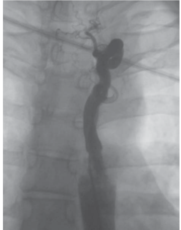
Figure 1. Collateral vessels.

left interscapular area and in the 2 nd –3 rd left intercostal space. Blood pressure on the upper limbs was 155/95 mm Hg. Chest radiography showed normal cardiac silhouette, abnormal contour of the aorta and rib notching. Echocardiography revealed morphologically severe stenosis of the aortic isthmus with a pressure gradient that was difficult to measure, and slow flow in the abdominal aorta. Cardiac chamber dimensions were normal for body mass, and the thickness of left ventricular myocardium was increased by 22%. In addition, bileaflet aortic valve and an atrial septal defect with a diameter of 12 mm and a left-to-right shunt were found. The patient was scheduled for an attempt at percutaneous dilatation of CoA. Simultaneous closure of the atrial septal defect was also contemplated but the patient did not agree to the latter due to financial reasons.