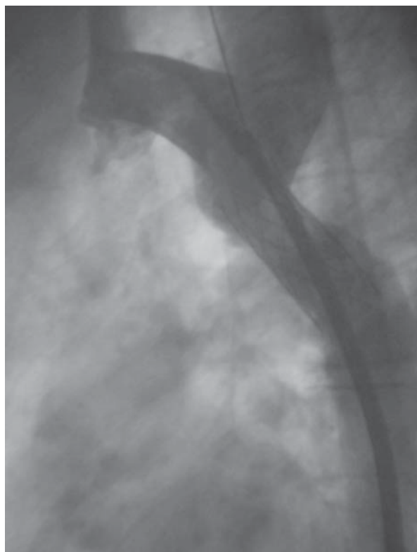
Figure 4. Aortography after stent implantation.