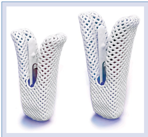
Figure 1. TriClip NT-TriClip XT implant.