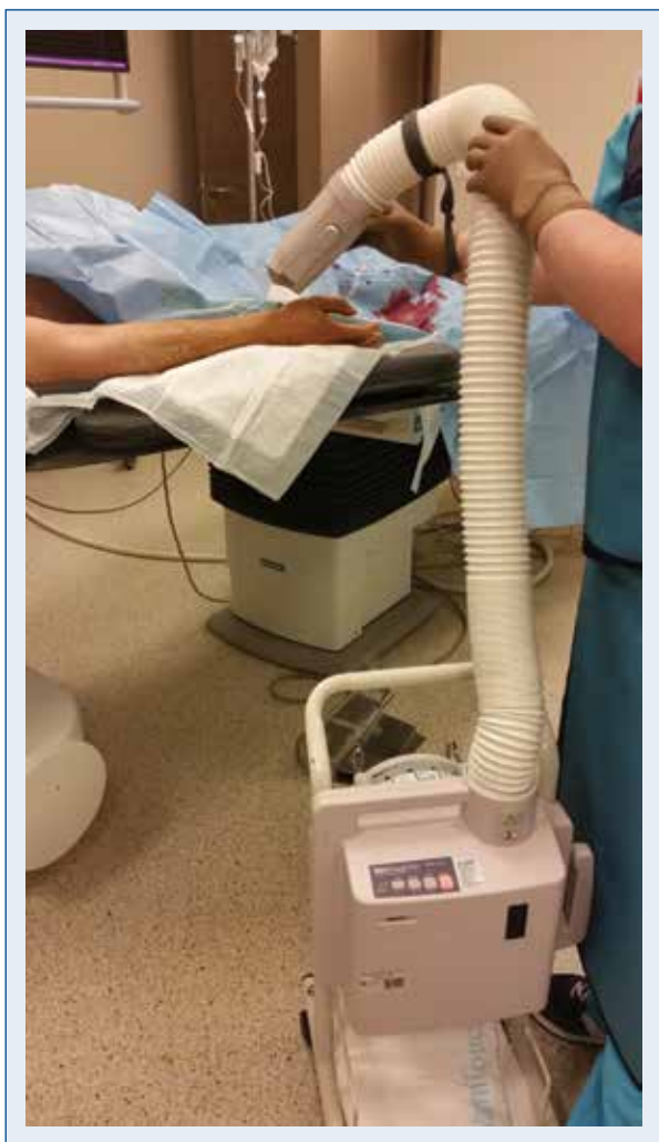
Figure 2. Forearm heating with a convective air patient warming system (Warm Touch, model WT-5300 A, Covidien, Mansfield, USA) in a patient with catheter entrapment.

gender, young age, low body mass index, short stature, small radial artery diameter, diabetes mellitus, dyslipidemia, anxiety, anomalous radial artery), and technical factors (low radial artery to sheath ratio, non-hydrophilic coated sheaths, unsuccessful access at first attempt, prolonged cannulation, multiple catheter exchanges, excessive catheter manipulations, limited operator experience) [8, 13, 15–17, 22–24]. In the present study, it was demonstrated that the catheter entrapment-associated factors were similar to these previously defined factors.