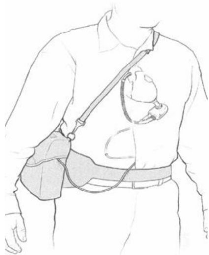
Figure 1. Diagram of the HeartMate XVE implantation.

After LVAD implantation the application of \beta -adrenolytics (carvedilol and next bisoprolol) was possible in the therapy of heart failure. Embolic complications (microembolia to the cerebral arteries) and inflammatory complications (local infection of the post-surgical wound) were observed but these were not life-threatening. Staphylococcus aureus and Citrobacter Koseri were cultured on material taken from the LVAD cannula. In targeted antibiotic therapy vancomicine and ticarcillin with clavulanic acid i.v. were used temporarily and flucloxacillin in intracardiac infusion (PICC line) and moxifloxacin 400 mg per os .