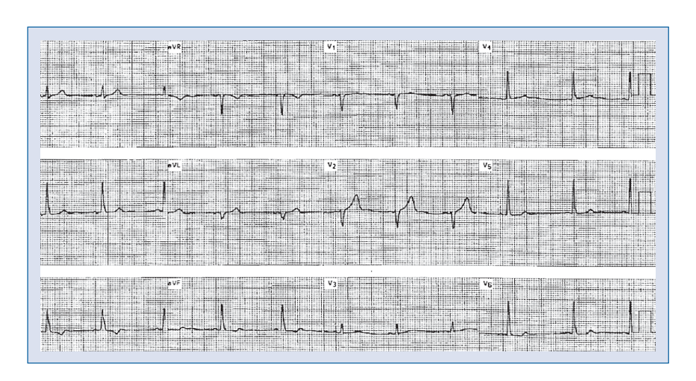
Figure 1. Rest phase of the treadmill: electrocardiogram recording.

CPVT is an unusual cause of syncope and sudden death in children and adolescents with normal QTc interval and no structural cardiac abnormalities [1]. In Figure 1, sinus bradycardia can be seen. It has been associated with this disease by several