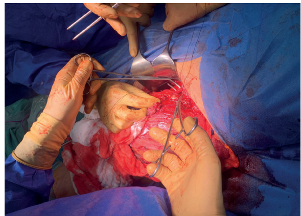
Figure 2. Transfixing sutures of the left common artery. The specimen can be seen to the left of the picture

It is quite difficult to standardize such a rare operation as the external hemipelvectomy. In a recent meta-analysis, only 5 studies of 183 patients were found to compare the results