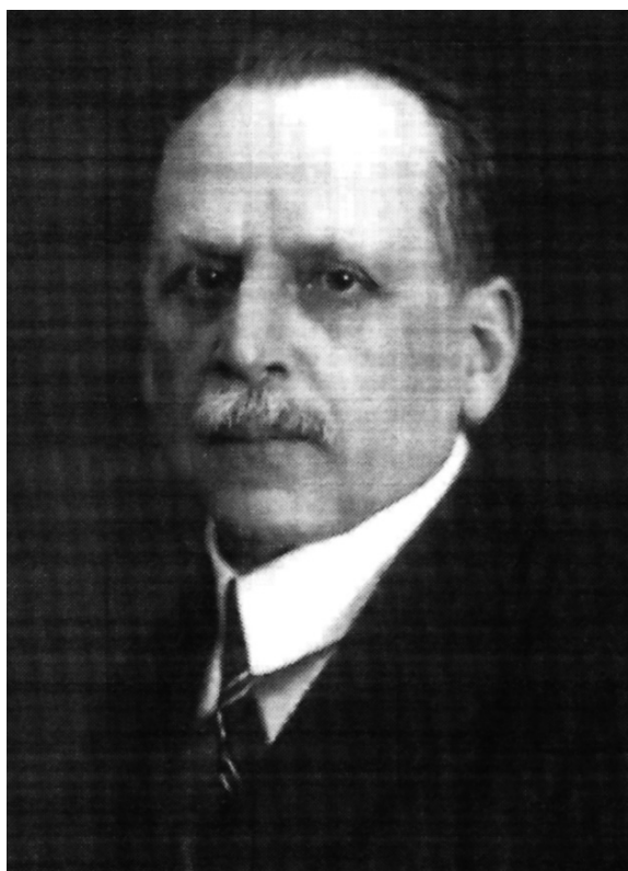
Figure 1. Leopold Freund

The patient was a girl of age 5-years under the care of Schiff who describes the case history as follows [1]. "It was a naevus pigmentosus pilosus , extending over the whole of the back, which was thickly covered with hair. It was a very unfavourable one, for it had been long treated by the usual methods without results. Freund undertook an experiment with the X-rays, and this treatment I watched carefully during its entire course.