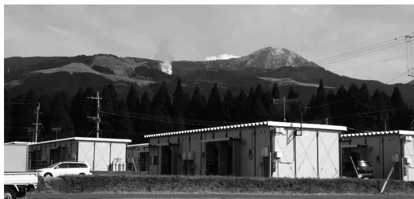
Figure 1. Temporary housing complexes in Minami Aso Village in Kumamoto Prefecture

The UCG screening was performed in the temporary housing complexes in Minami Aso village in Kumamoto Prefecture over a period of 2 days, December 24 and 25, 2016 (Fig. 1). The subjects participated in the screening on a voluntary basis, when our medical examination program using UCG aimed at preventing disaster-related diseases was announced. The screening was performed on 60 subjects who were the residents of the temporary housing. Of these subjects, we excluded four individuals with atrial fibrillation, and the analysis was performed using the data of 56 subjects (10 men, 46 women; mean age = 71.0 \pm 13.8 years). Subjects with hypertension were defined as those previously diagnosed with hypertension according to their response in the ques-