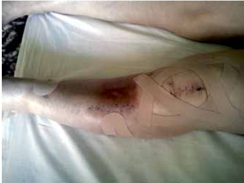
Figure 3. Kinesio taping — fascial applications (Case report no. 3)