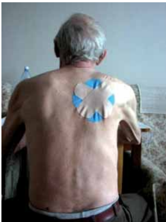
Figure 1. Kinesio taping — trigger point application, lower trapezius fibres (Case report no. 1)

4–5), which was successfully treated with tramadol (150 mg a day) and spinal column stabilization, using lumbo-sacral orthosis. Unfortunately, the patient also suffered from constipation. As a source of abdominal pain, this significantly decreased her quality of life. Unfortunately, laxatives proved to be ineffective. Lengthy immobilization was thought to be one of the constipation risk factors and, therefore, physiotherapy was recommended. The main aims of the physiotherapy were to increase physical activity, decrease the tenseness of the abdominal integuments and stimulate peristaltic movement. The physiotherapy started with myofascial release (MFR), which included the release of the rectus abdominis, pyramidalis, abdominal obliques and transversus abdominis. To perform MFR, special grips are used to stretch the fascia and release bonds between the fascia, integuments and muscles. MFR is a set of very convenient and effective stretching techniques. What is important for patients with constipation is that the MFR techniques are very gentle and do not increase abdominal pain. The release of tightness and restriction can affect other body organs through a reflex relaxation of tension transmitted by the greater fascial system [7]. This can benefit pain re-