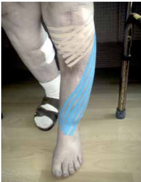
Figure 4. Kinesio Taping — lymphatic applications (Case report no. 3)

lishes an individual's needs by demonstrating their current impairments as well as any restrictions in daily activities. It also highlights all the treatable symptoms and aspects of a disease. In this article the