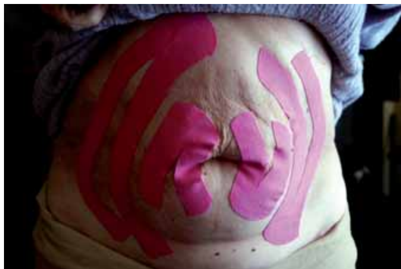
Figure 2. Kinesio taping — spiral application for intestines (Case report no. 2)

tion, the limb was X-rayed, but there was no union of the fractured bone. The patient then agreed to surgery and in June 2010 she underwent intramedullary osteosynthesis. A week later the patient was released home.