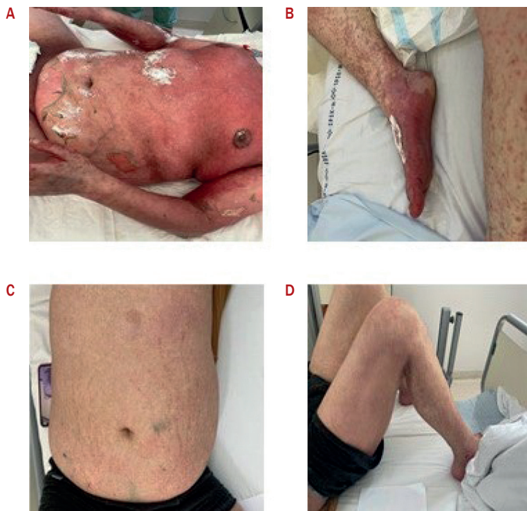
Figure 1. Skin changes in course of TEN before (A, B) and after (C, D) treatment

remained negative. All drugs that are responsible for TEN development and protraction were discontinued. The patient was then transferred to the Burns Center, where surgical treatment with amniotic membranes was used. These were applied over denuded areas, replaced after three days and removed on day 4 of the second application, resulting in a complete resolution of the skin changes (Figure 1C, D). Now, 12 months after allo-HSCT, the patient's condition is stable. The PET scan is free of lymphoma.