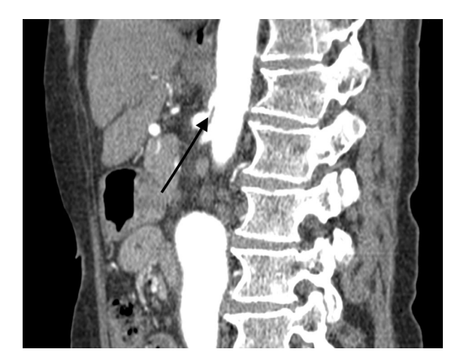
Figure 1. Coeliac trunk compression (arrow)