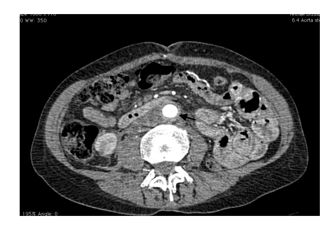
Figure 3. Aorta enveloped with portion of Dacron graft (arrow)