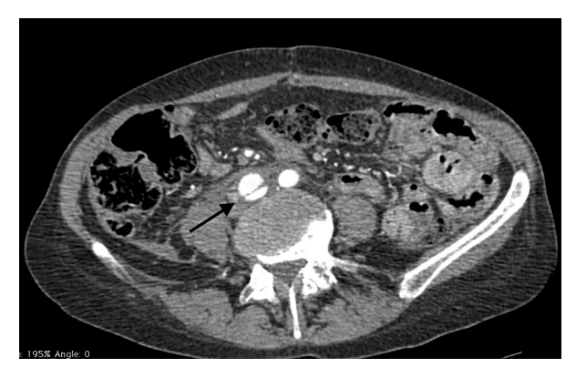
Figure 4. Dissection of right common iliac artery (arrow)

The patient was operated upon and rupture of the abdominal aortic aneurysm was found. In order to control bleeding, the aorta was closed below the diaphragm. The aorta was then dissected below the renal arteries and closed with a vascular clamp at the level of the left renal vein. At the level of the inferior mesenteric artery, there was a visible rupture of the aortic wall with a short dissection visible in its lumen. The fragility of the aorta wall prevented safe suturing of the prosthesis. For this reason, a portion of a Dacron<sup>®</sup> graft was used to envelop the aorta at the level of the rupture (Fig. 3). After releasing the vascular clamps, the flow through the aorta was normal with a well-palpable pulse over the femoral arteries. In the area of the aorta, haemostatic material was left, in order to facilitate improved haemostasis.