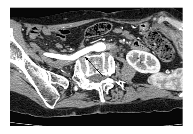
Figure 6. Patent right common iliac and external iliac arteries

in size. During the endovascular procedure, it was necessary to cover the ostium of the right internal iliac artery. The control angiography revealed slight leakage into the false channel.